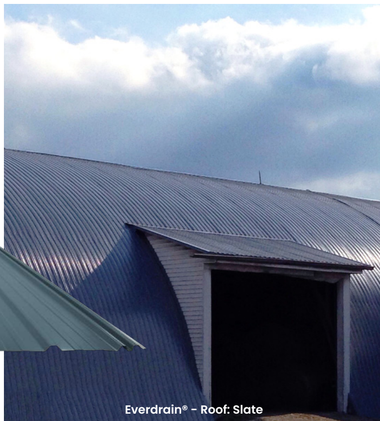
Everdrain® – Roof: Slate